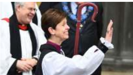
At the consecration at York