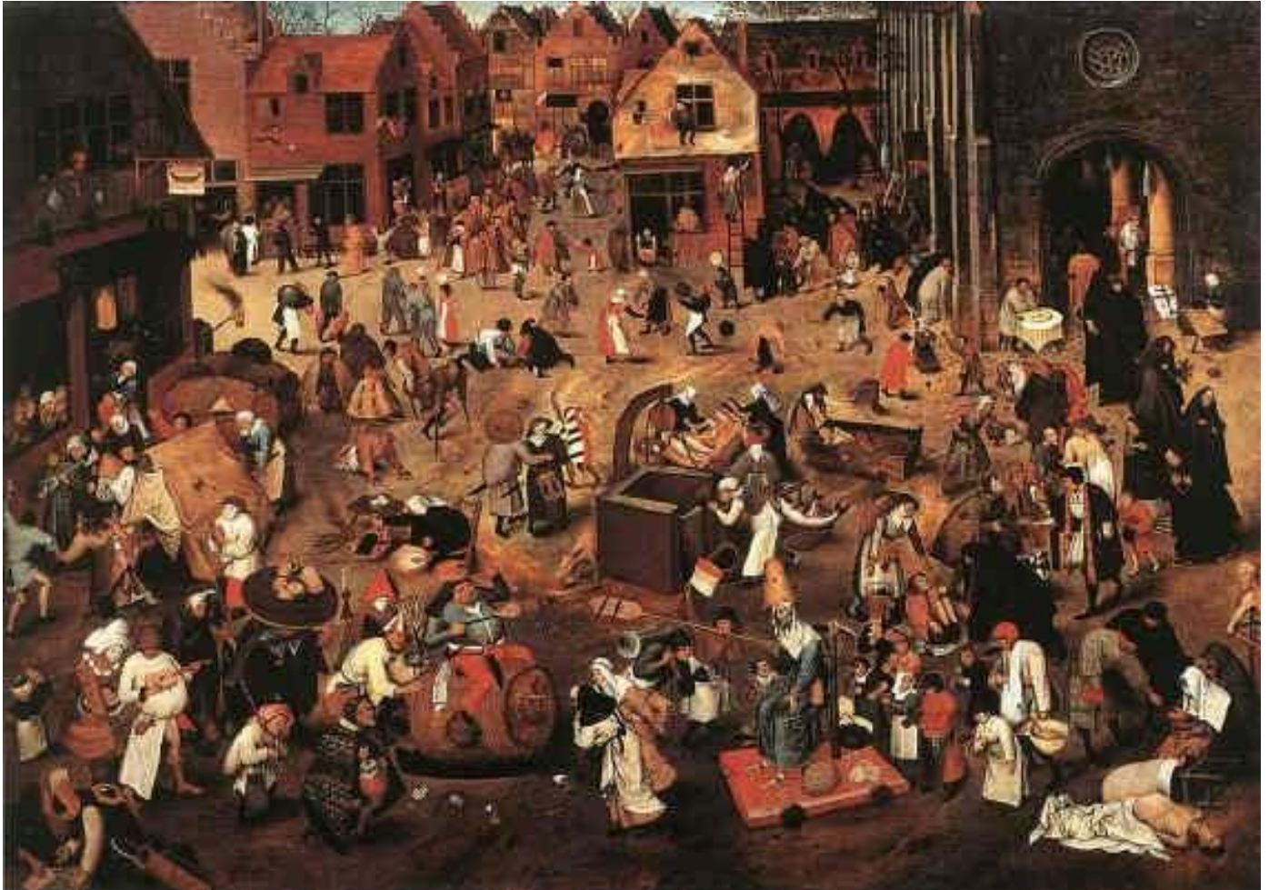
The Fight Between Carnival and Lent by Pieter Bruegel the Elder (1569). The subject is the threshold between two cycles in the liturgical calendar, the moment when the last feast of winter must give way to Lenten fasting.

It might seem that for some the fight was won by carnival: —————>